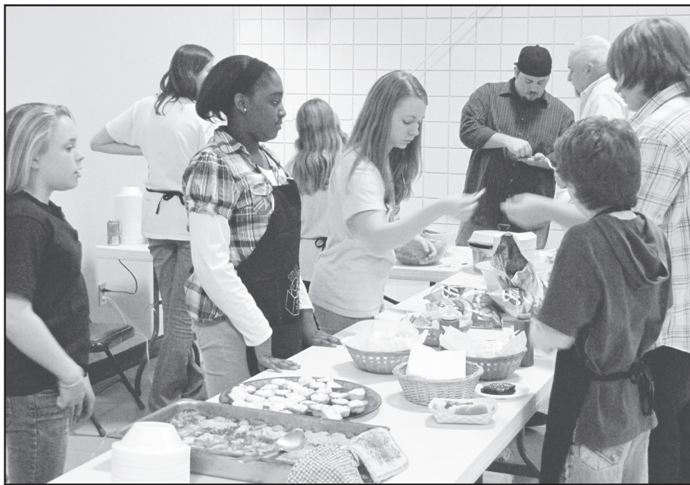
Members of the JFUMC Youth group prepare the serving line for last year's Chili Cook Off.